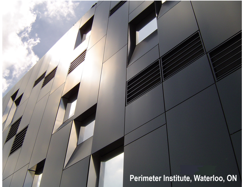
Perimeter Institute, Waterloo, ON

ACM is manufactured in the standard thickness of 5/32" (4mm). Also available in 1/8" (3mm) and 1/4" (6mm). Standard sheet widths are 40" (1020mm), 49" (1250mm) and 62" (1575mm). There is no limitation on the length but within a length of 19'6" (6000mm) is recommended for convenient handling and delivery purposes.