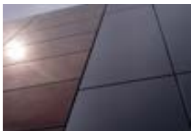
Solstex® - Solar Facade