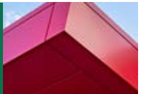
Aluminum Composite Material (ACM)